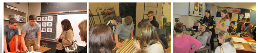
NexTier Bank Visit and EITC Check Presentation—February 28, 2018