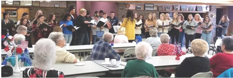
A-R's High School chorus performed at the Center's Veterans Day program.