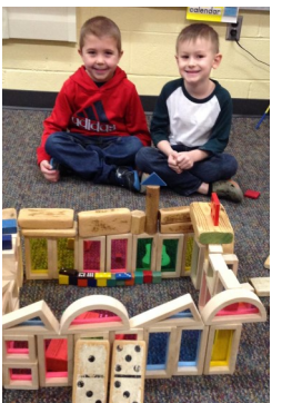
Innovative Projects Grant Building to Create Young Thinkers