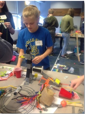
Middle School students participated in WeDIG’s Rube Goldberg Challenge at Penn State New Kensington for the first time in November. The Education Foundation funded this opportunity in addition to paying fees for High School students to compete in Quiz Bowl.