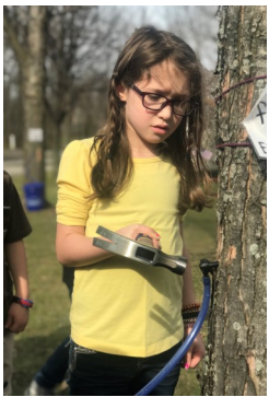
Innovative Projects Grant Elementary science students were rewarded with a pancake breakfast using syrup they made from tree sap.

Sustaining members are invaluable contributors to the Foundation’s ability to fund Innovative Project Grants. $3371 in membership dues were received from payroll deductions in 2017-2018